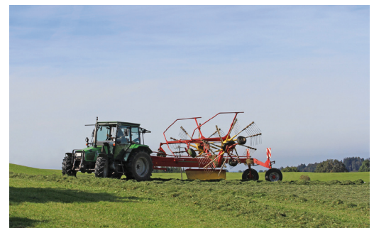
Application example in the agriculture